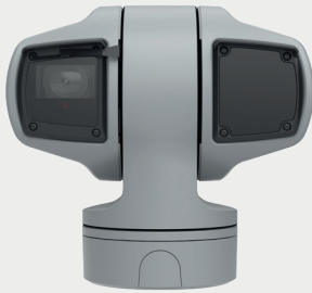
Axis PTZ cameras

PTZ cameras deliver real-time monitoring for wide areas thanks to pan, tilt, and zoom functionality. AXIS Q61 Series provides full scene fidelity and perfect image quality in all directions – above as well as below the horizon. This makes the series uniquely suitable when there is slightly uneven terrain. AXIS Q62 Series includes heavy-duty cameras that stand up to all weather conditions. AXIS Q63 Series provides quick zoom and laser focus, even in the dark. With speed dry functionality, you get clear, crisp images even in rainy weather.