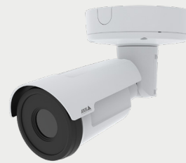
AXIS Q1961-TE Thermal Camera

This halogen-free, thermometric camera lets you remotely monitor temperatures and trigger temperature-based events. Ideal for improving operational efficiency. Robust and impact-resistant, it offers early fire detection analytics and built-in cybersecurity features.