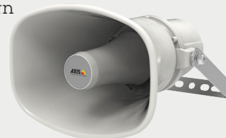
Axis network horn speakers

Axis network horn speakers allow you to discourage unwelcome activity and warn off bad actors detected by your cameras. For example, the speakers can be used to deter unwanted presence/activity by a site's perimeter. The speakers can also be used to provide voice instructions during an emergency or inform about illegal parking.