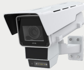
Axis radar-fusion cameras

Get wide-area intrusion protection and reliable 24/7 detection with a fusion of two powerful technologies: video and radar. This unique device provides state-of-the-art deep learning-powered object classification for next-level detection and visualization.