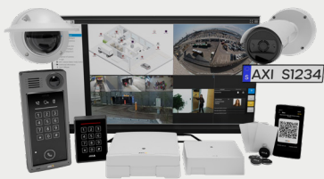
Axis access control

Axis provides the hardware and analytics to identify, authenticate, and authorize entry to buildings and rooms. Our access control technology protects critical or vulnerable areas with automatic (key cards, PIN codes, QR codes) or manual authentication (2-way network video and audio).