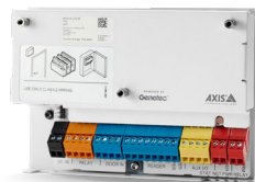
AXIS A1210 barebone Powered by Genetec