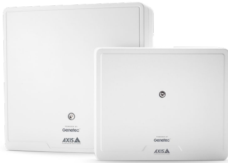
AXIS A1610 Powered by Genetec